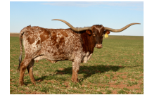
SL SELENA'S ACE