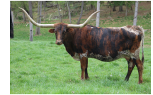
BL RIO GIZZY 933