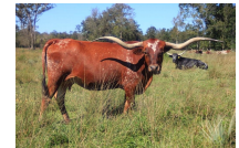
HORSESHOE J ADVANCE