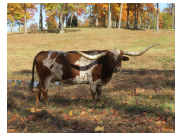
HORSESHOE J DELICIOUS