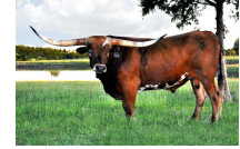
HUNTS GRAND COMMAND