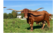
HUBBELLS RIO GLORY