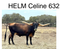
HELM Celine 632