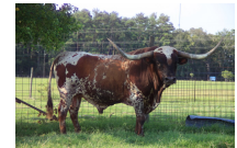
J S OVERDRIVE